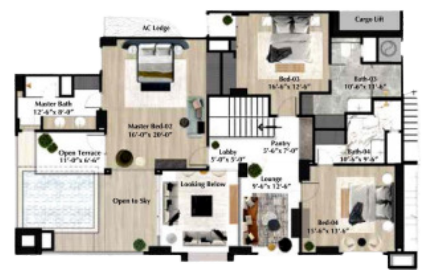
Type - B