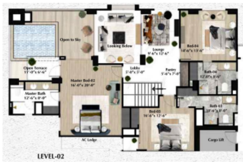
Type - C