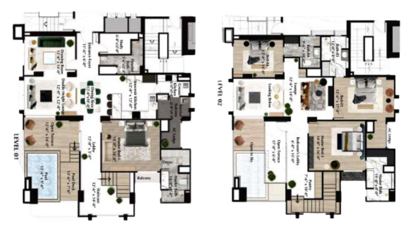
Type - A