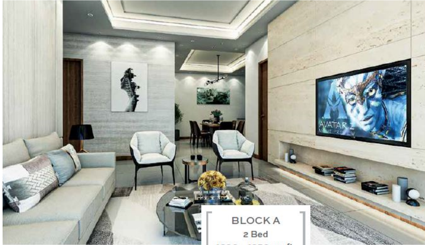
BLOCK A 2 Bed 1600 - 1850 sq. ft. 3 Bed 2130 - 2260 sq. ft.